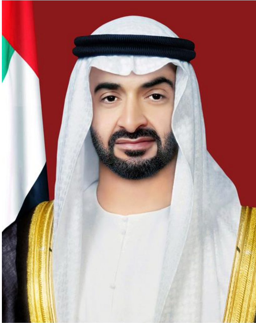
محمد بن زايد آل نهيان رئيس دولة الإمارات العربية المتحدة HIS HIGHNESS SHEIKH MOHAMMED BIN ZAYED AL NAHYAN PRESIDENT OF THE UNITED ARAB EMIRATES