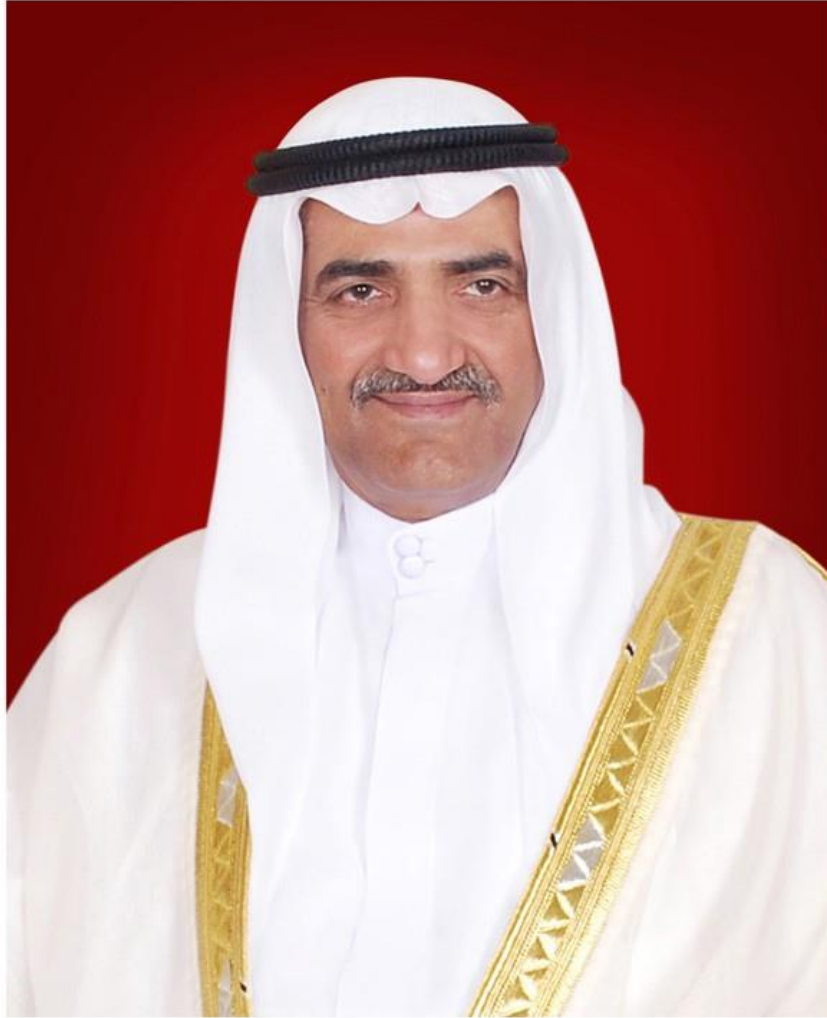
صاحب السمو الشيخ محمد بن محمد الشرفي عضو المجلس الأعلى حاكم فجيرة